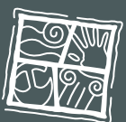
Exhibit ready date: _____

B) Please give an estimated date of when you expect to be ready to exhibit. Suggestions of when you would like to have an exhibit are welcome but the committee will make the final decisions.